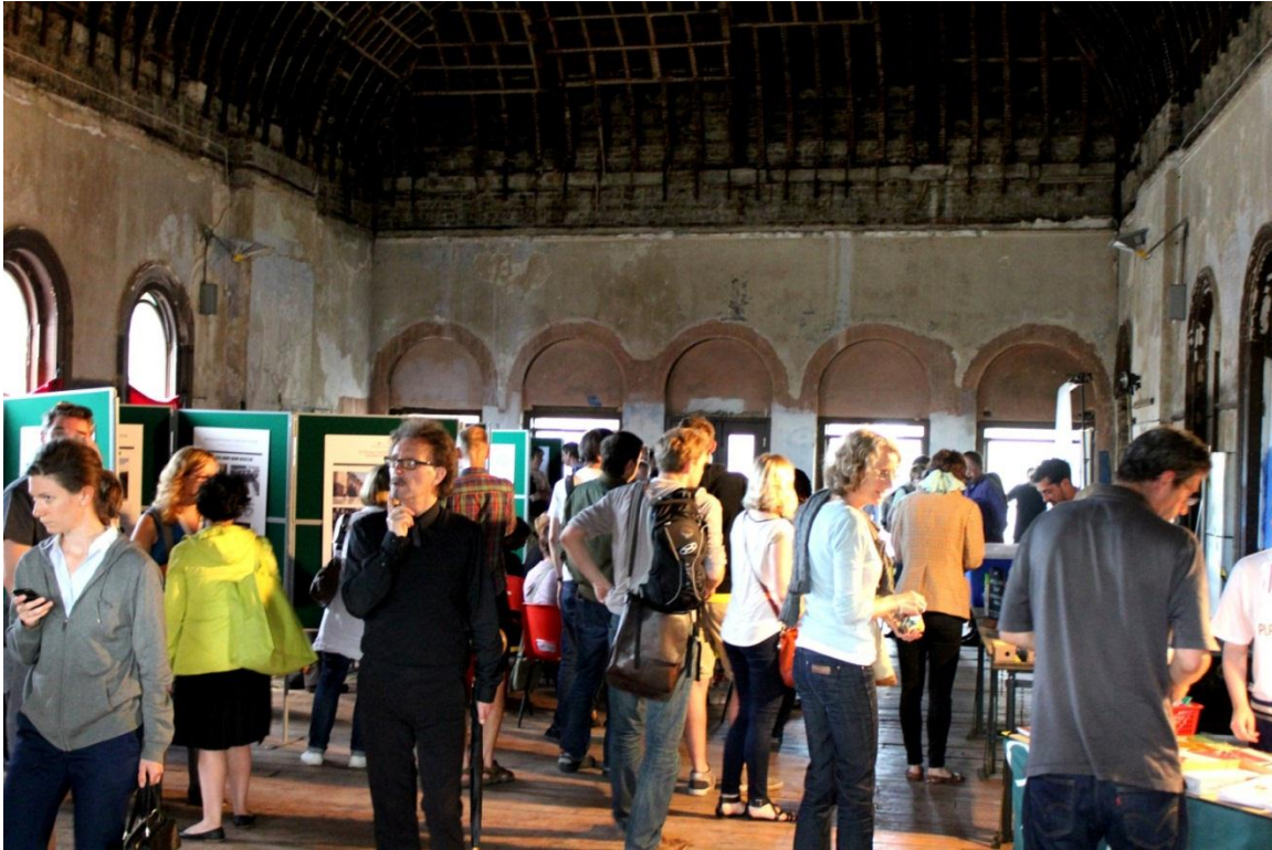
Peckham Vision Town Centre Exhibition, The Old Waiting Room, Peckham Rye Station 2nd – 4th August 2012

http://www.peckhamvision.org/wiki/Old_Waiting_Room