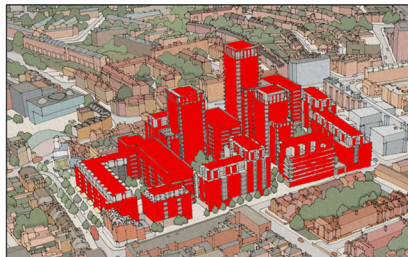
2023 – Berkeley Homes

Berkeley Homes first scheme withdrawn after 7,000 local people protest and Southwark Council say the scheme "requires reconsideration"