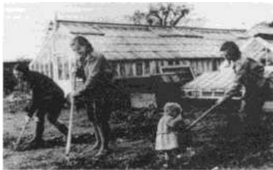
Top: St Mary's Road 1935-1950. Bottom left: Queen's Road 1926-9. Bottom right: War years – Farm at Bromley

Do you have memories of the Peckham Experiment?