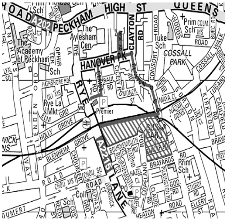
A map showing tram route options 1 and 2 in grey running from the bus station behind The Aylesham Centre.