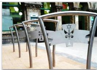
New cycle racks with station motif