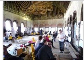
OWR after refenestration, architectural students' workshop