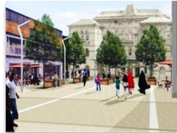
Vision of restored station square