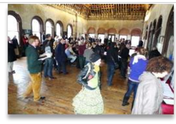
31 Mar 2011 Community event in OWR on historic Peckham, with English Heritage