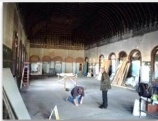
OWR before restoration