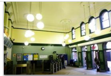
Original colours in repainted ticket hall