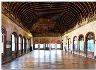
Old Waiting Room restored for occasional use