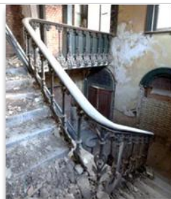
Original iron and stone staircase now being restored