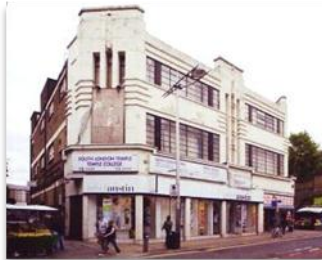
Network Rail building, opposite station