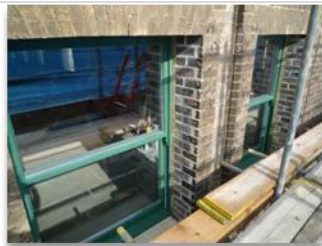
Restoration of OWR windows