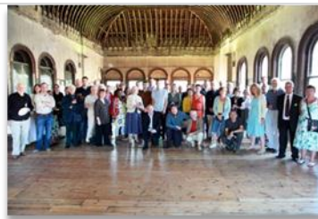
Celebration of restoration July 2010