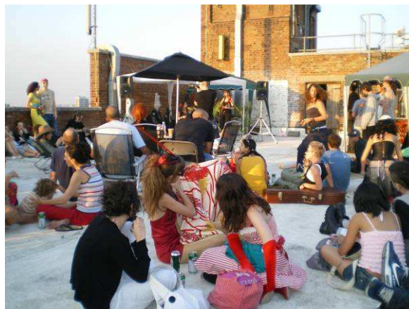
Some of the creative new uses in the Bussey building

Creative new uses in these historic buildings are already taking place, led naturally by the local property market meeting emerging new demands for accommodation. In September 2007, in the annual all-London Open House weekend, Peckham Vision arranged three walks to show what is already happening. This revealed to all present the immense scope and opportunities there are for reusing the historic industrial and commercial buildings in Rye Lane Central in modern developments for creative 21st century uses. Over 140 people came from across London and locally to take the walks led by The Peckham Society. Everyone enjoyed the magnificent views of Peckham and central London from the roof of the Bussey building, the refreshments in the CLF Arts Café and the Peckham Vision exhibition showing the latest information about the tram, and ideas for new opportunities for this central area of Peckham if the tram depot is not located there. There was significant support and enthusiasm for revising this part of Peckham town centre to enable its potential to be realised. There was much demand for further tours, indicating that these kinds of developments could attract visitors to Peckham, who would not visit a tram depot.