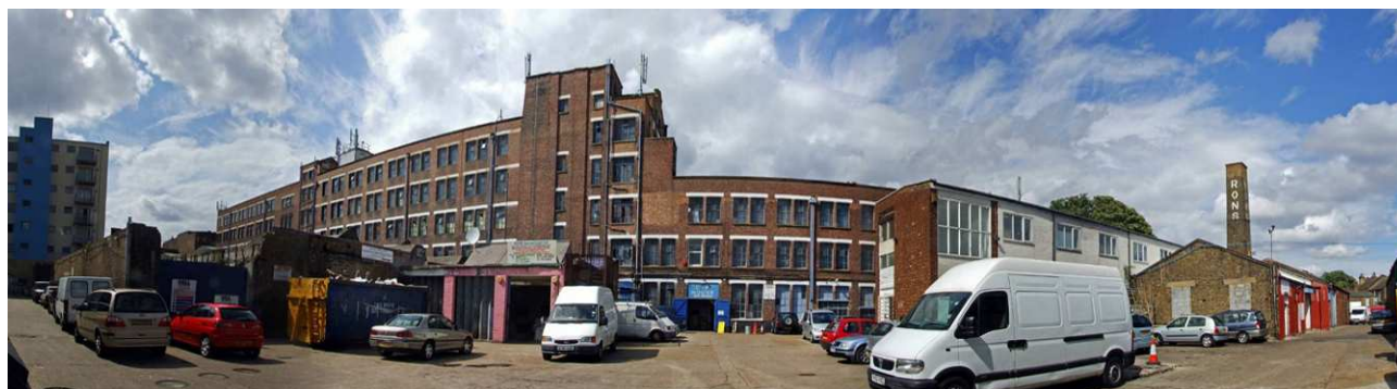
The Bussey Building today

It is essential that the Council's Issues and Options paper includes these topics to enable an informed and adequate public consultation about the future of Peckham town centre.