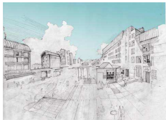
Some sketches of future possibilities Benedict O’Looney, architect