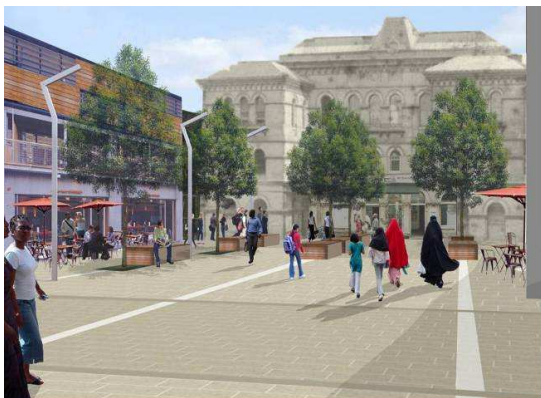
New vision for Peckham Rye station, with an open public square

This is already evident in the recent agreement between all key stakeholders to examine the feasibility of opening up the piazza in front of Peckham Rye Station.