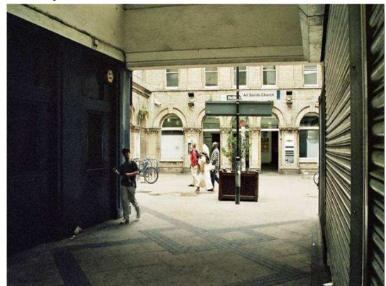
Peckham Rye station, as it is today