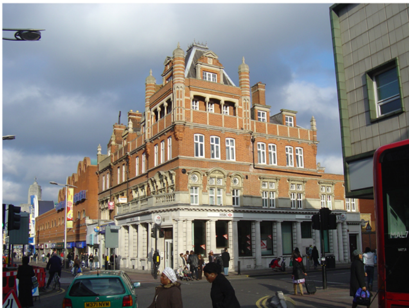
The HSBC Bank, a remarkable and lively example of London's Edwardian Architecture