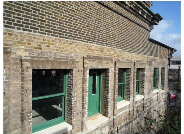
The South elevation restored

The Peckham Rye Station will always be one of the most important public facilities in Peckham, and the restoration of the station has made people look again at this historic asset and feel safer using the building. The Peckham Society believes we could build on the previous successful Cleaner Greener Safer bid to restore the elevations, and now stabilize and uplift the interior so we can begin to use this remarkable space for community purposes once again!