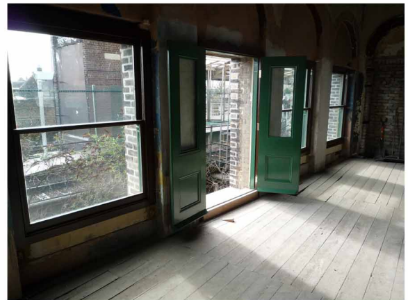
New doors and windows carefully matching the Victorian originals